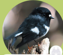
Miromiro (male) North Island tomtit