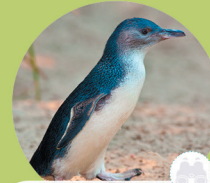
Kororā Blue penguin