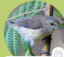
Riroriro Grey warbler