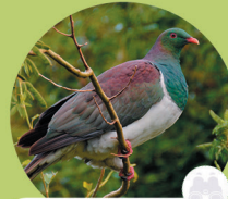
Kukupa New Zealand pigeon