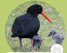
Tōrea Variable oystercatcher