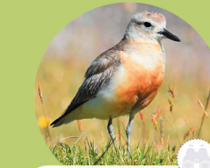
Tūturiwhatu New Zealand dotterel