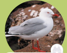
Tarāpunga Red-billed gull