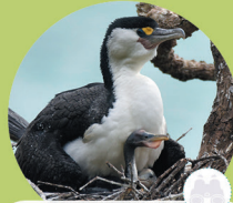
Kāruhiruhi Pied shag