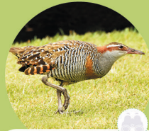
Mioweka Banded rail