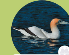
Takapu Australasian gannet