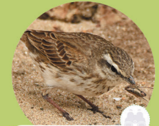
Pīhoihoi New Zealand pipit