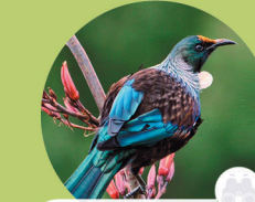
Tūi Parson bird