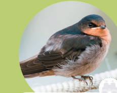
Warou Welcome swallow