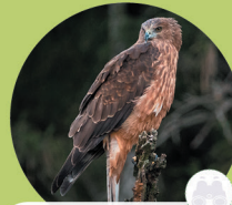
Kahu Australasian harrier