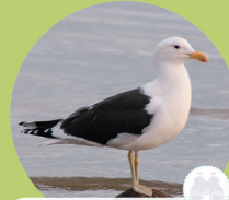
Karoro Black-backed gull