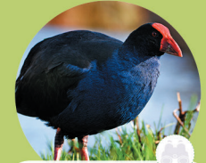
Pūkeko Purple swamphen